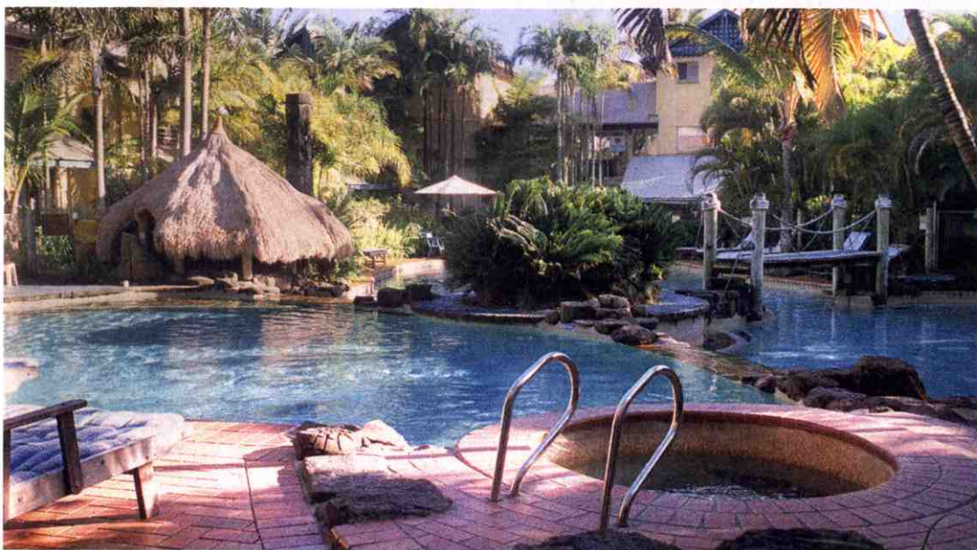
Taking the plunge: Poolside pleasure and shady huts at the Islander Resort

But if you have had a long day at the beach and just want a night in, a supermarket, video store and bottle shop are also